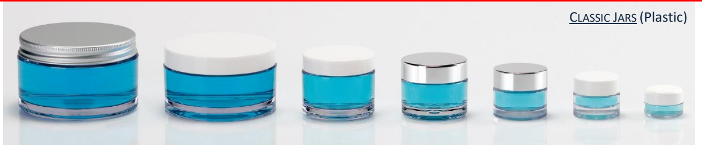
Classic Jar 200 ml – Crystal PETG Aluminium lid