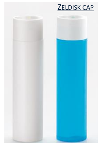
Zeldisk cap 48 diameter Classic FH bottle 250 ml – White PE Special neck